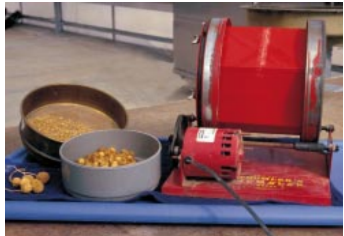
Figure 2. At Los Lunas Plant Materials Center, dry fruiting heads of Arizona sycamore, seen lower left, are crushed under water in a large pan. The hairs agglomerate into balls (gray sieve in foreground). A slurry of achenes and pea gravel are tumbled in the rock tumbler to dislodge the hairs. Finally, the achenes, hairs, and pea gravel are separated with soil sieves with the cleaned achenes visible in the brass sieve (background).