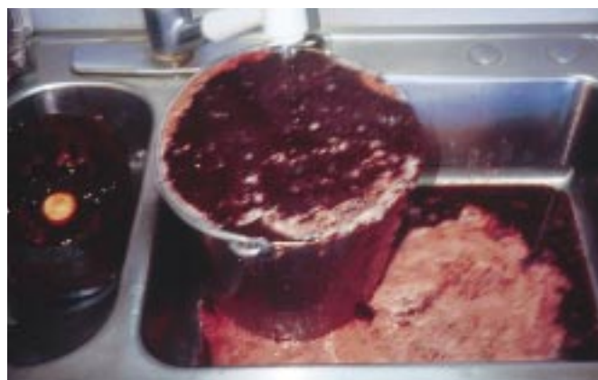
Figure 2. Floating the debris away from clean seeds.