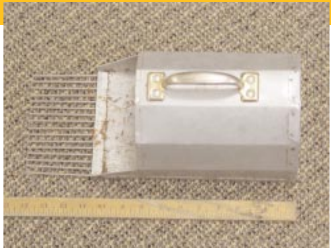
Figure 2. A custom-made metal harvester for collecting fruits.