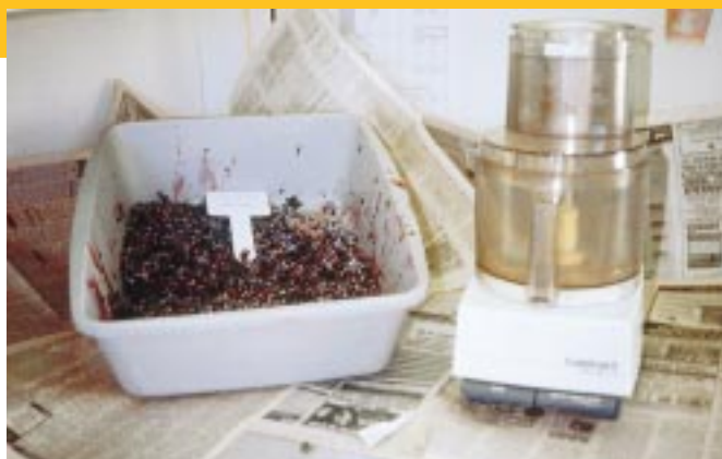
Figure 1. Elderberry fruits ready for cleaning and my trusty food processor.

USDA NRCS. 2002. The PLANTS database, version 3.5. URL: http://plants.usda.gov (accessed 14 Aug 2003). Baton Rouge (LA): The National Plant Data Center.