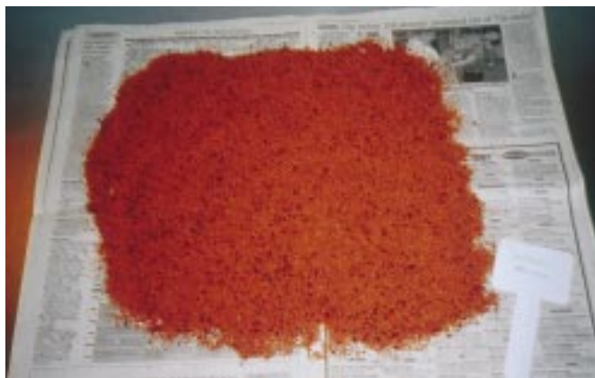
Figure 3. Clean elderberry seeds ready for storage.