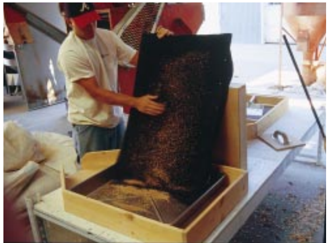
Figure 2. When tossed at a piece of felt, desired Asteraceae seeds fall into a collection pan but unwanted grass seeds, with their prickly appendages, are caught on the felt.